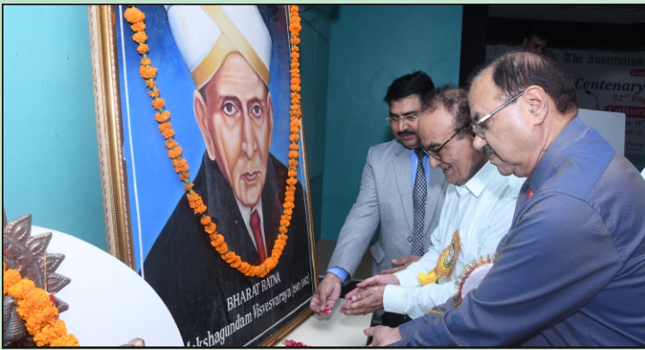
Chairman/ Honorary Secretary & other eminent Engineers Inaugural Cultural EVE by lighting the lamp