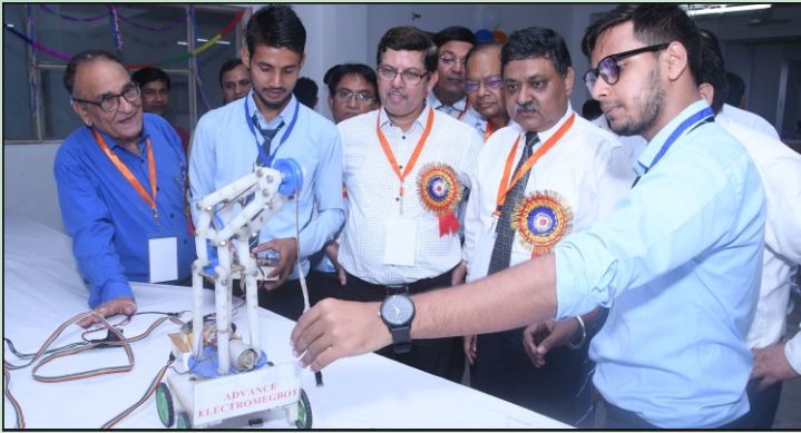
A view of participants busy with their gadgets