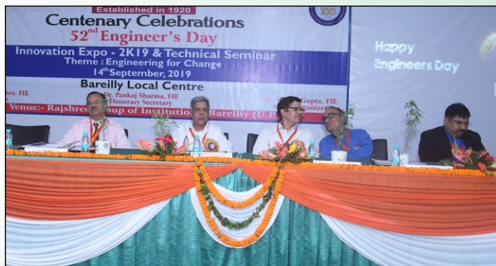
View of Dias

To initiate the interaction between the concerned persons of various Institutes and Engineering Colleges at every level, it was thought that some Technical activity should be organized so as to provide the opportunity to assemble student & faculty members on a common platform. This idea of organizing Innovation Expo 2K19 would not only enhance the interaction but also harness inculcation of sense of competitiveness in the Students so as to improve their quality & ultimately their personality development.