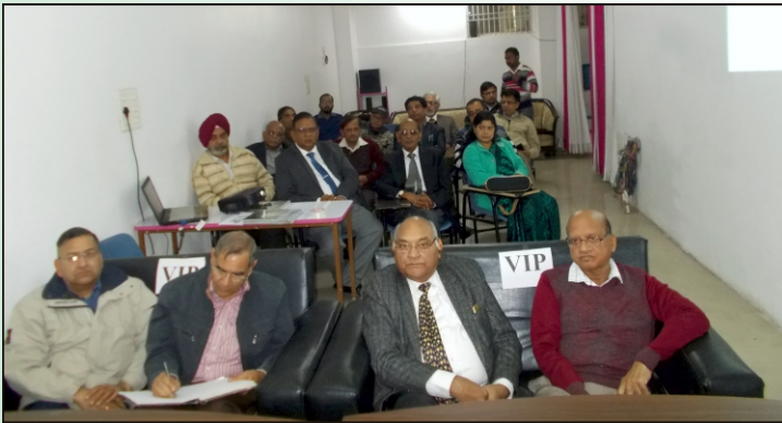
Galaxy of participants attending Guest Lecture on 'Energy Conservation Day-2019.'

Following speaker was present to express their papers on Energy Conservation Day along with practical examples, which were applauded whole heartedly by the audience: