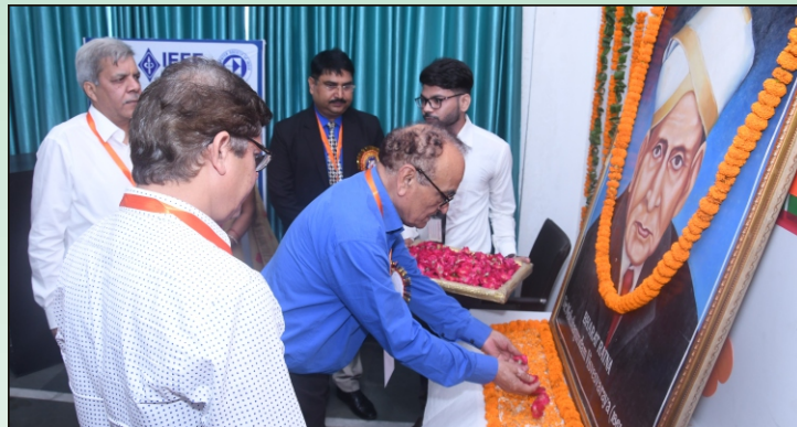
Lighting the lamp and garlanding of 'Bharat Ratna Sir M. Visvesvaraya's portrait.

INNOVATION EXPO – 2K19 on “Various Technical Exhibits – Operational Models & Conceptual Software” & TECHNICAL SEMINAR on “Engineering for Change” at Rajshree Institute of Management & Technology, Bareilly on 14th September, 2019.