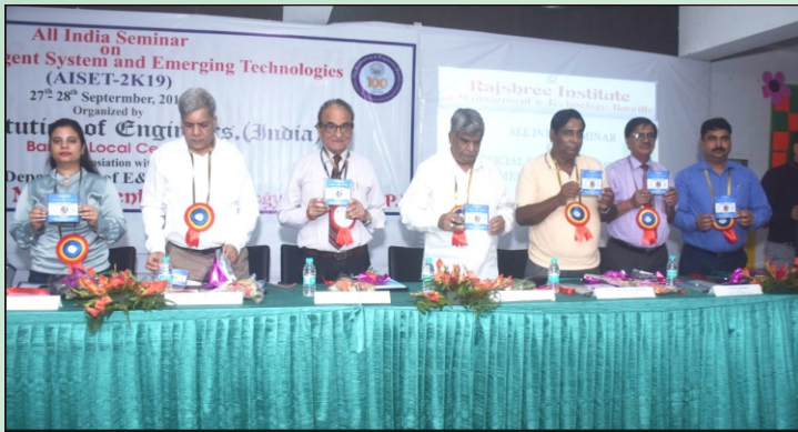
Release of CD Souvenir

talks and many initiatives by the government, like the ambitious Ayushman Bharat scheme, the mammoth task of implementation still hovers given the scale of India's population.