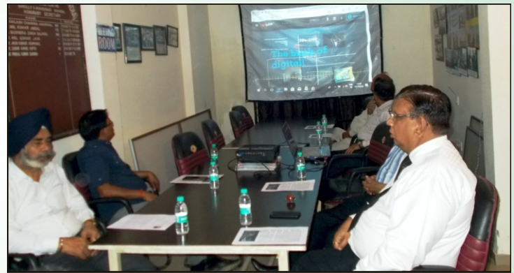
View of Participants