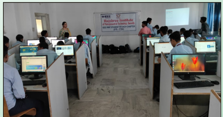
Photo of Technical Session