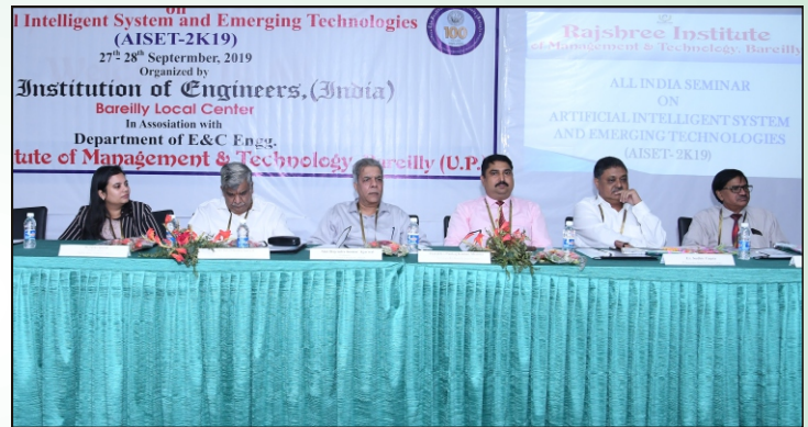
Dias View Inaugural