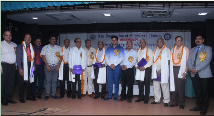
Felicitations of Sr. Engineers