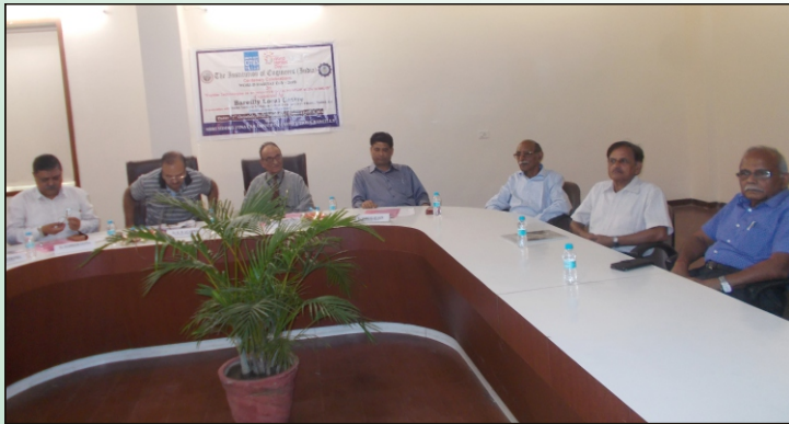
View of Dias