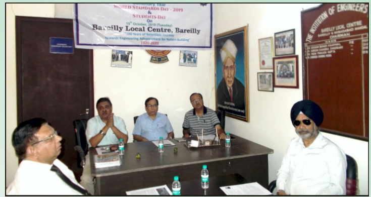
View of Dias

World Standards Day on the theme "Video standards create a global stage" was organized at the Committee Hall of Bareilly Local Centre, IEI.