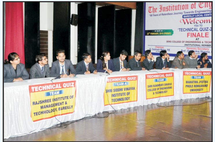
A view of Teams

Both the rounds were conducted by Er. Sudhir Gupta successfully and were applauded by the participating teams