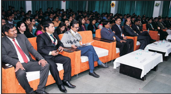
View of Delegates

Pantnagar, Uttarakhand - 'Characterization of Ferrite Particles on the Basis of Crystal Structure used as Filler Polymer Composite'.