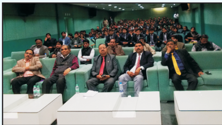
View of Delegates

Considering an Engineer’s working span of 35-40 years through which he goes across several practical on the job problems and acquires ample skill and experience to troubleshoot them which may immensely be helpful and valuable to other fellow engineers , engineering faculty and students to enrich their knowledge and understanding to deal with the same kind of problems may come their way in future , it was thought to organize an event to share such