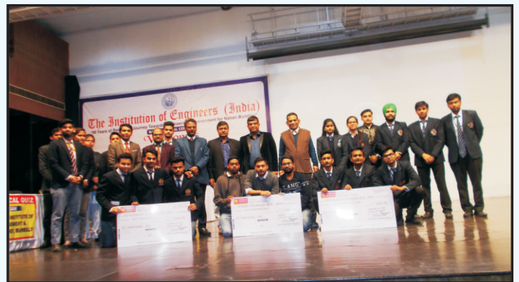
Group photo Winning Teams