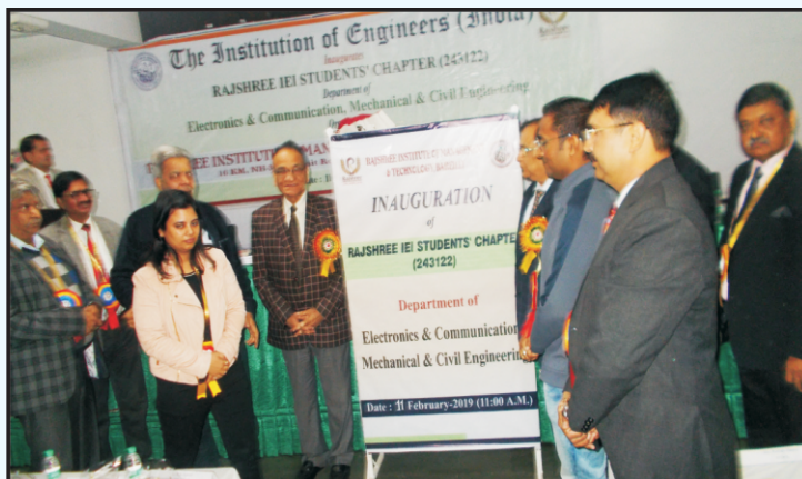
Inauguration of Students' Chapter

and Electronics & Communication Engineering was inaugurated at Rajshree Institute of Management Group of Institutions, Bareilly comprising 20 students each in every Branch.