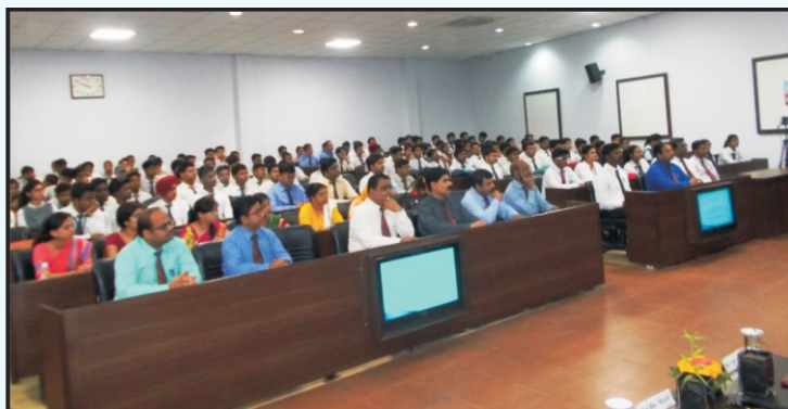
View of Participants on One Day National Seminar

Thus, a very interactive and successful one day National seminar was conducted which will prove to be very useful and helpful for the students interested in the field of Microwave and Antenna.