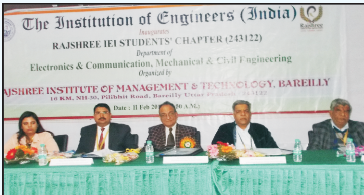
View of Dias