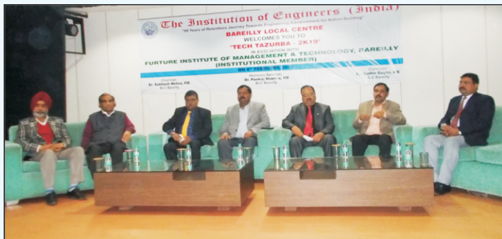
View of Dias

TECH TAZURBA 2K19 AT FUTURE INSTITUTE OF ENGINEERING & TECHNOLOGY, BAREILLY ON 8TH FEBRUARY, 2019