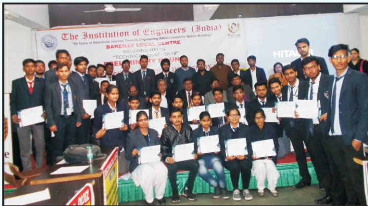
A view of galaxy of students participants Technical Quiz 2k19 Technology, Bareilly