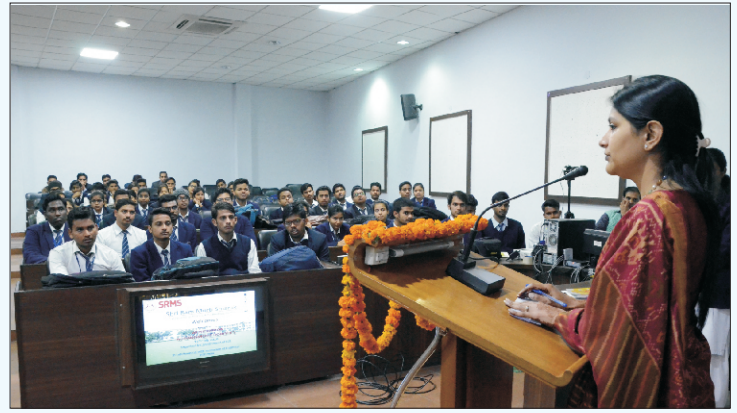
A view of the workshop in progress

Several engineering students fabricated the Robot Models to carryout automation activities be it Industry, Commercial or domestic which were appreciated by the eminent engineers who advised them to be in rapport with the Industry to make it more meaningful and application friendly.