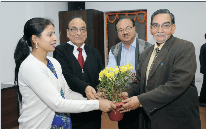
Eminent engineers were welcomed in the Workshop