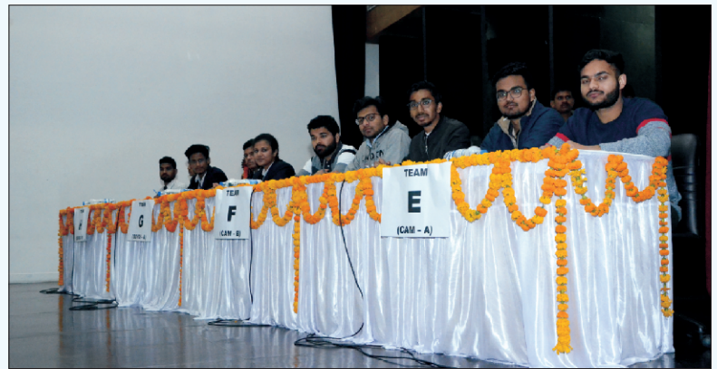
A view of galaxy of students participants Technical Quiz 2k18