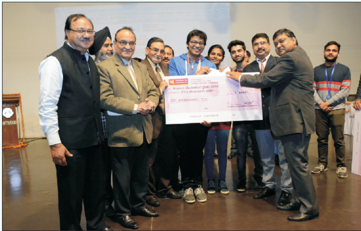
Group Photo of Winner