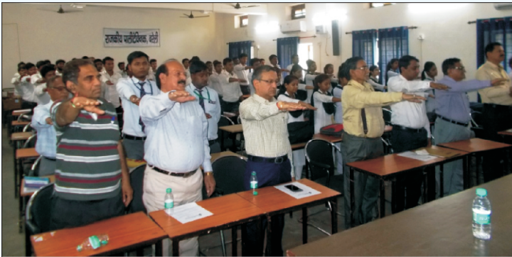
Participants on "World Water Day -2018" programme