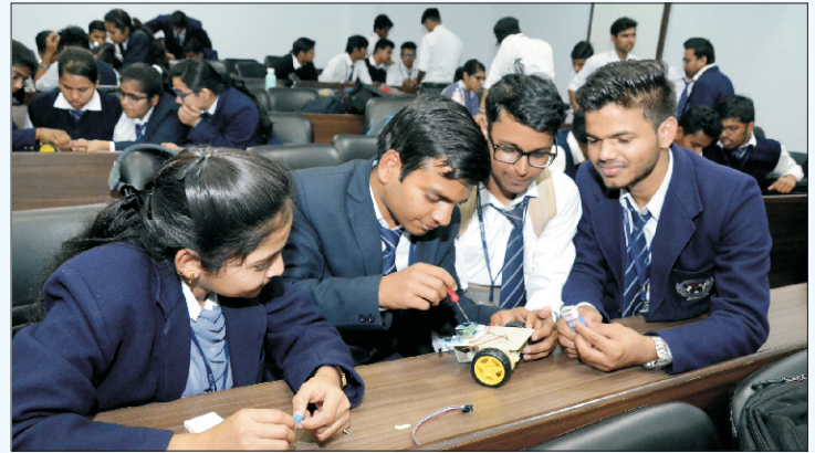
A view of participants busy with their gadgets