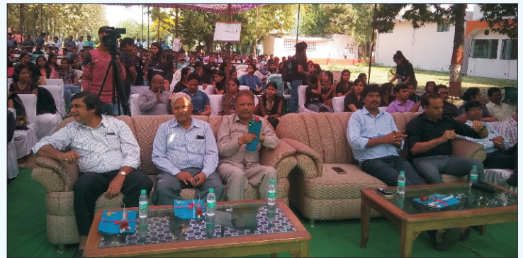
A Galaxy of participants attending