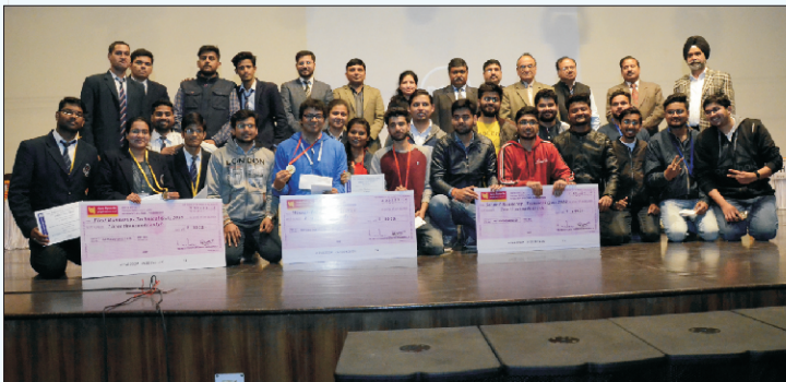
Group Photo Winning Teams