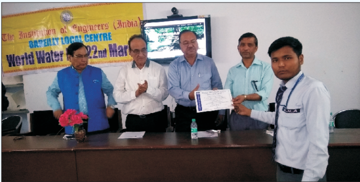
Eminent Engineers presenting certificate on World Water Day-2018