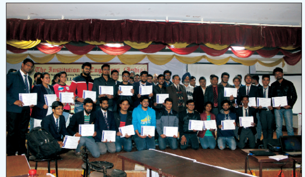
A view of galaxy of students participants Technical Quiz 2k18

2. Finale was organized at SRMS College of Engineering and Technology, Bareilly (Institutional Member)