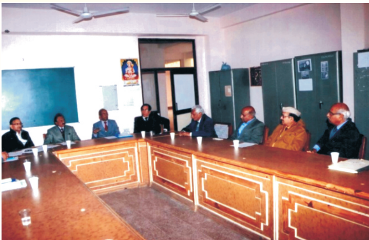
A view of the Committee Meeting being conducted at MIT, Moradabad.