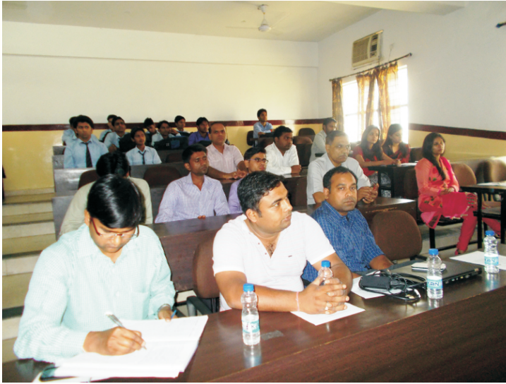
Galaxy of participants attending seminar on 'World Telecommunication and Information Society Day (WTISD 2016)'