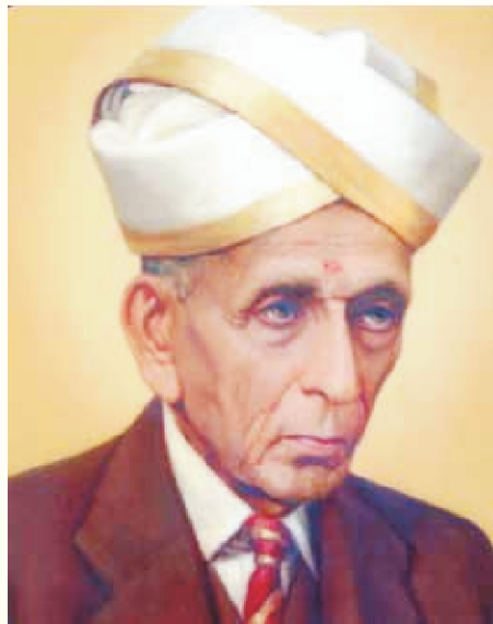
Bharat Ratna Sir M Visvesvaraya

September 15 is celebrated every year in the country as "Engineers' Day" to commemorate the birthday of the legendary engineer Sir Mokshagundam Visvesvaraya. Sir Visvesvaraya, an eminent Indian engineer and statesman was born in a remote village of Karnataka, the State that is incidentally now the Hi-tech State of the country. Due to his outstanding contribution to the society, Government of India conferred "Bharat Ratna" on this legend in the year 1955. He was also called the precursor of economic planning in India. His learned discourse on economic planning in India, Planned Economy for India and Reconstructing India, was the first available document on the planning effort of the country and it is still held as the parent source matter for economic planners.