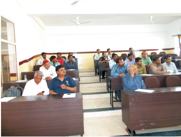
A view of galaxy of Engineers attending the seminar on World Water Day-2016.