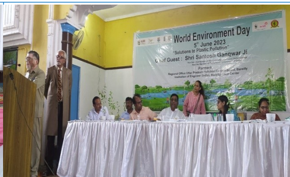
Address by Shri Santosh Gangwar, Hon'ble MP & Chairman of the Parliamentary Committee (PSE), Government of India