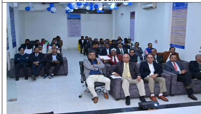
View of Delegates