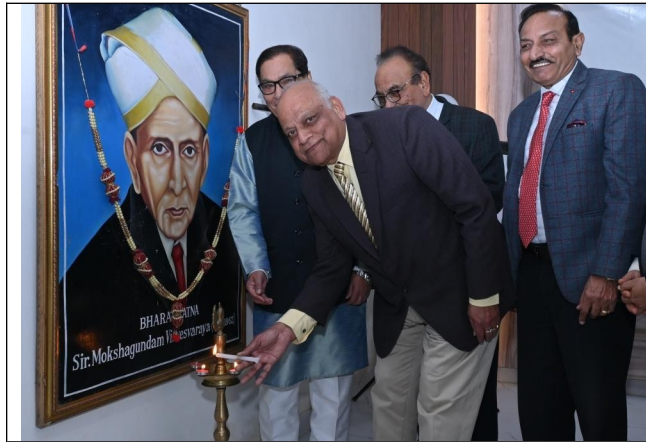
Eminent Engineers, inauguration the All India Seminar lighting the lamp