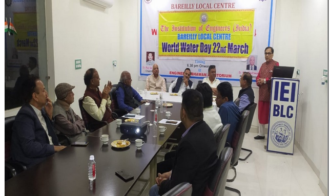
Photo Technical Session