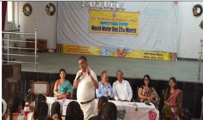
Photo Technical Session